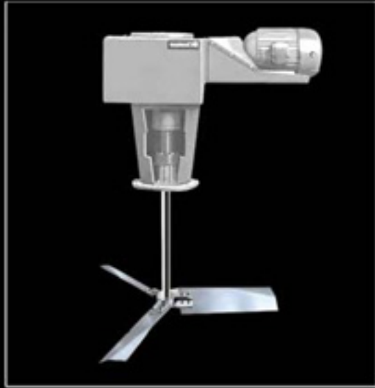
Chemineer HT Agitator