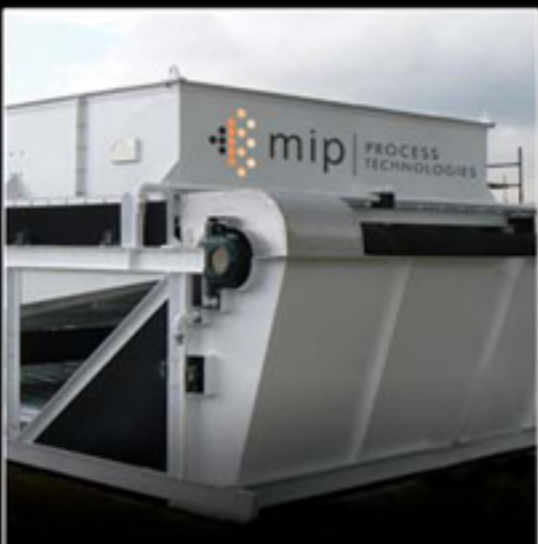
30m 2 Linear Screen