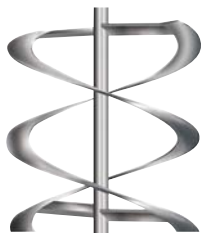
Double Helical Ribbon