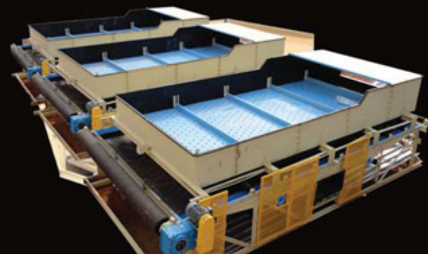
Three 34m 2 Linear Screens