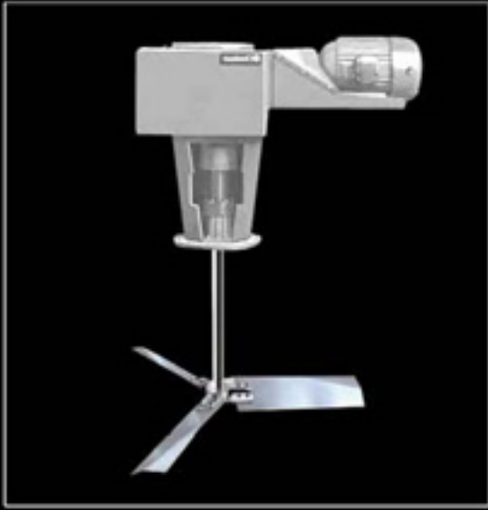
Chemineer HT Agitator