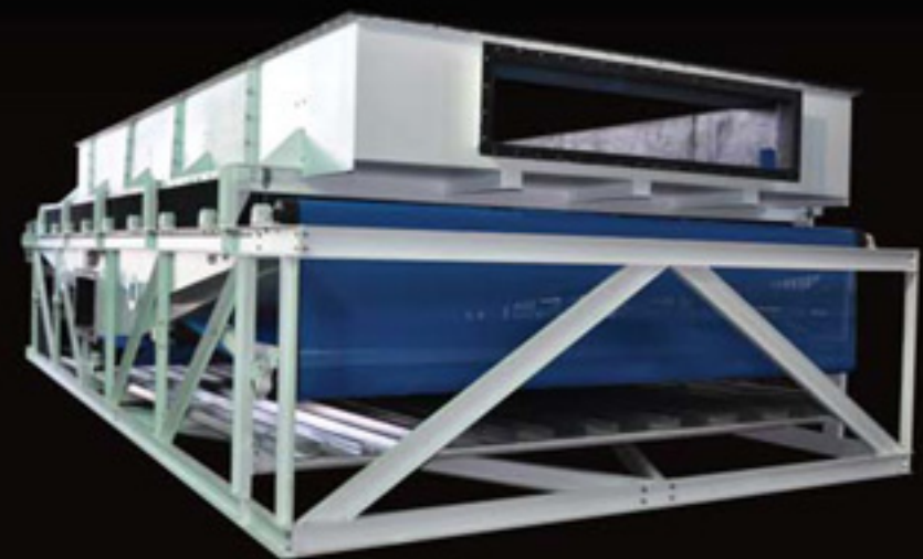
30m 2 screen with cloth