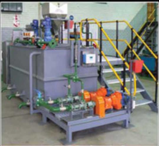
MIP-200 Flocculant Plant