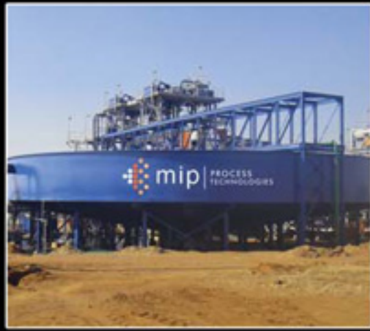
26m \phi Thickener in operation