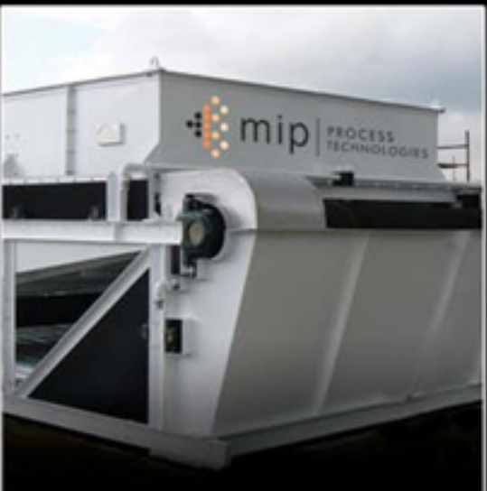
30m 2 Linear Screen